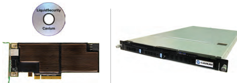
LiquidSecurity CNL35XX Network HSM Family